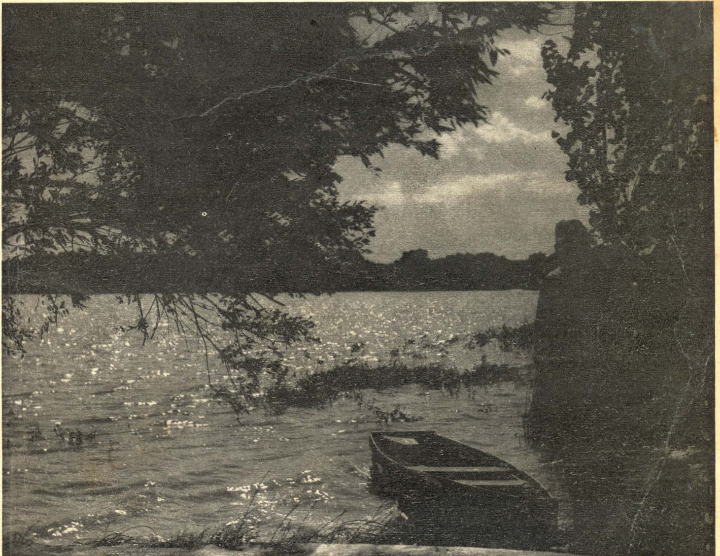
Meade County State Park.